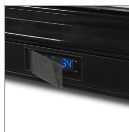
Protective thermostat cover